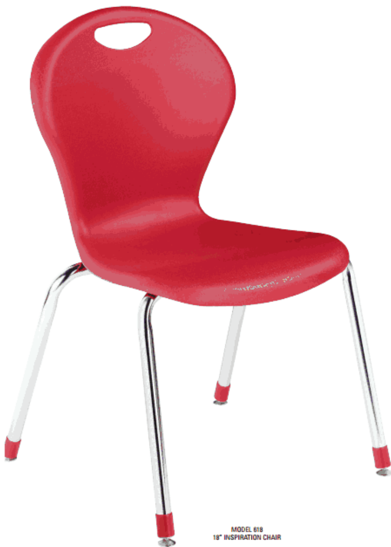
MODEL 618 18" INSPIRATION CHAIR