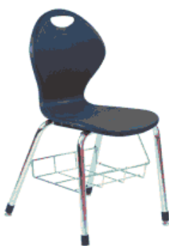
MODEL 618W/B CHAIR WITH BOOKBASKET