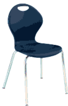
MODEL 718 VALUE CHAIR