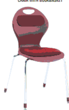
MODEL 618P WITH PADS