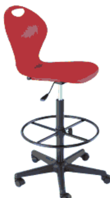
MODEL 688D DRAFTING STOOL