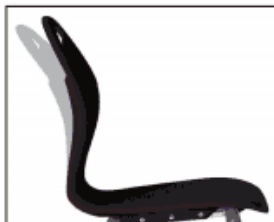
FLEX OF BACK