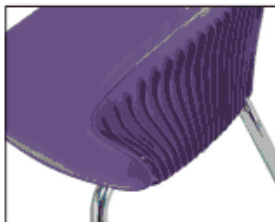
BACK WITH RIBS

From the built-in carry handle, to the chrome-plated steel to the color-coordinated boots, these chairs truly are an Inspiration.