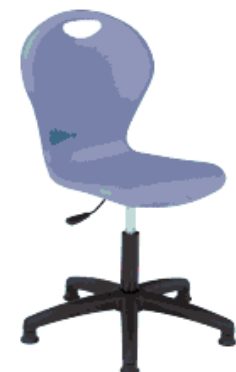
MODEL 658** SWIVEL BASE