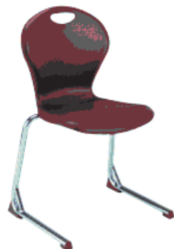
X-PLUS MODEL 688X CANTILEVER CHAIR